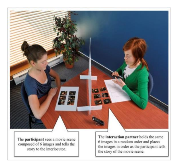
Fig. 1. Illustration of the collaborative interaction task.

The task and materials were the same as those used by Tshetiz et al. (2017), and a validated manipulation was added so that three of the six movie scenes were from films that were likely known by the majority of Indian women in their twenties (corresponding to our research assistants serving as the interaction partner; likely-known condition), while the other three movie scenes were from films that a lesser percentage of women would know (likely-unknown condition). The interaction partner was free to ask questions or offer feedback when the participant presented the movie sequences during the activity. As the interaction partner, a qualified research assistant took part. The research assistant was trained to act as though she was unaware of all the likely unknown movies; for instance, she would ask for more information if a participant referred to a character from a likely unknown movie solely by his name. The research assistant was familiar with all the likely known movies.